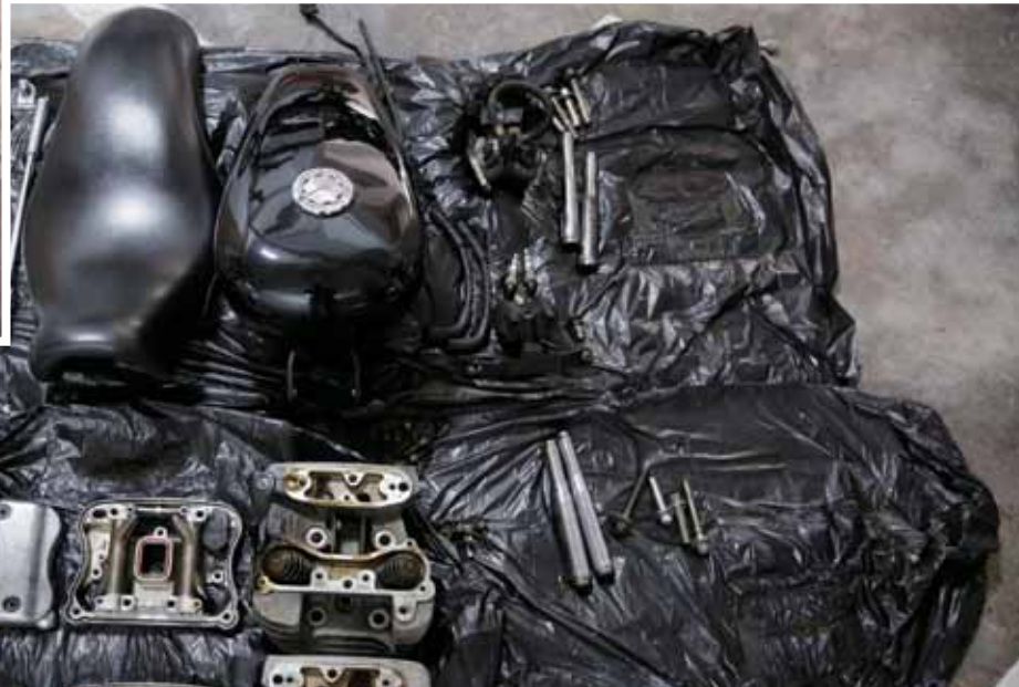
Picture (middle): The engine components and seat that were removed as part of the overhaul process.

Just cranking up the engine after the overhaul and listening to the new "thump-thump-thump" made it all worth the time and effort. 🏍️